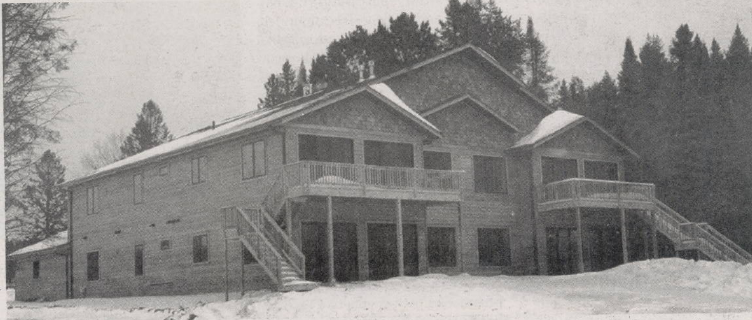
The Ice Lake Landing condo development near completion on the north shore of the popular lake. Four condo units are expected to be put on sale this spring.

All four condos will have southern exposure to the lake. "Fantastic views. Every one of them feels as if you are the only person on the lake."