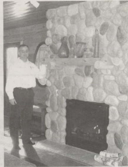
A glowing fireplace puts out a warm welcome to potential customers who visit the display model.

"We're now fully wireless and there's always new things going on."