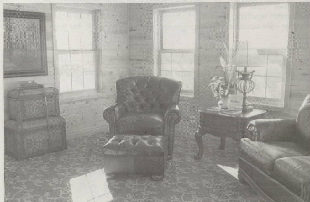
A sun-lit room provides the perfect place for relaxing after a hard day at work. The room is located off the main living space in the display model at Cottages to Castles.